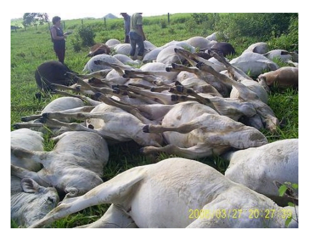
Image of the cattle died in Black Mount after the one fall "raio-bola" in the region center-north of Rondφnia.

In the occasion, the estragos had been wide bigger, with the register of 64 heads of cattle deceased instantaneamente after the sudden fall of a type of very rare electric discharge, the call "raio-bola".